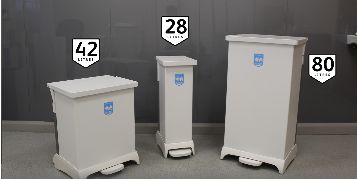
This hybrid, fire-retardant sackholder is available in 28, 42 and 80 litre sack sizes to suit any healthcare environment and offers easy maintenance, in your choice of lid and frame colour to segregate your healthcare waste correctly.