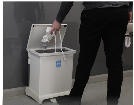
Includes a plastisol body with a steel, rust-resistant lid.