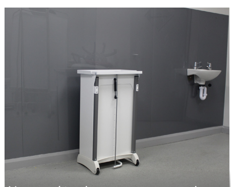
Non-marking base to stop ground or wall scratching.