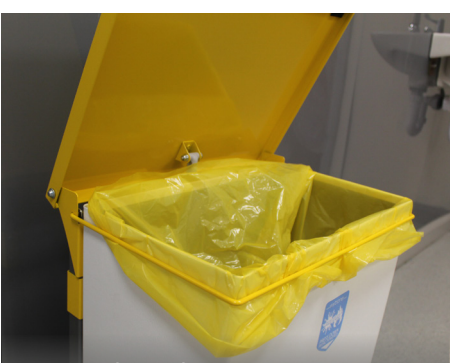
Leakproof tray for any punctured sacks to prevent leaking.