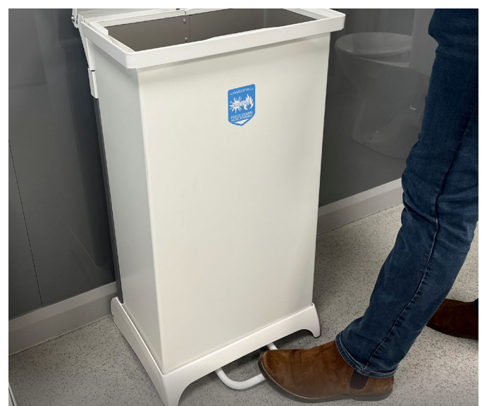
Our Hybrid Sackholders now come with the option of a plastic or metal pedal that lifts up the lid without having to use your hands.