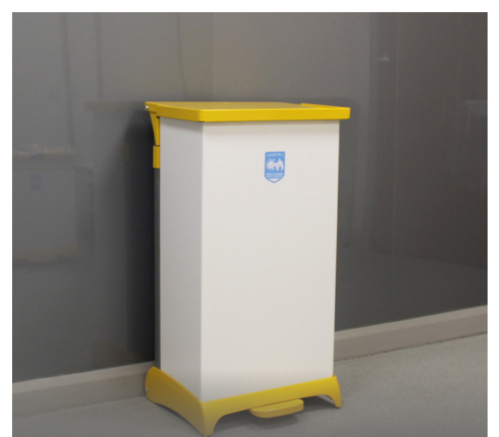
These Hybrid Sackholders get their name due to the galvanised steel lid, ABS plastic base and a plastisol body.